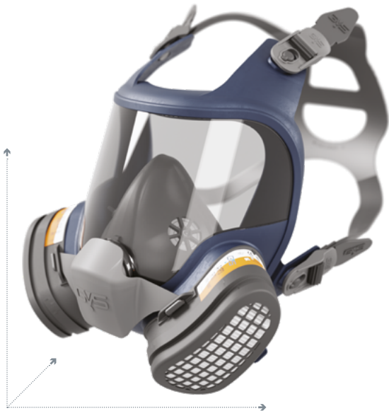
H: 178 mm D: 130 mm W: 166 mm