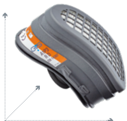
H: 97 mm D: 11 mm W: 53 mm