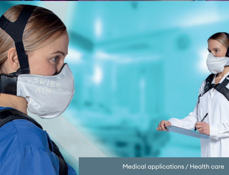
Medical applications / Health care