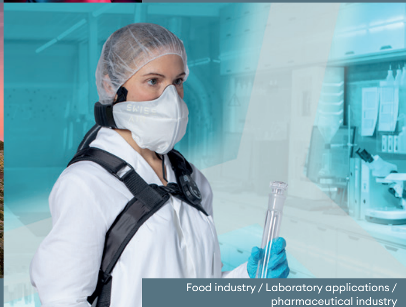
Food industry / Laboratory applications / pharmaceutical industry