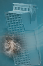
TH3 particle master filter