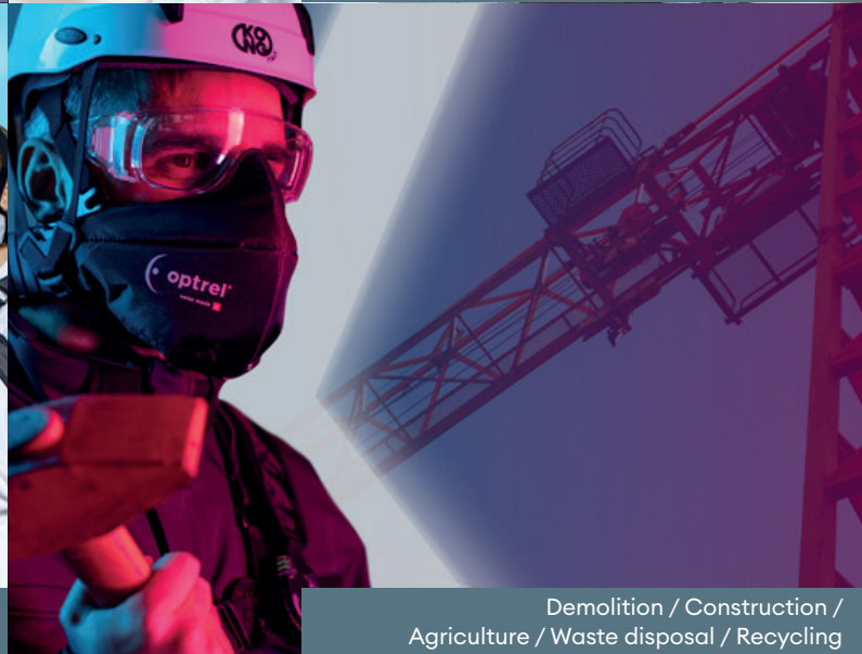
Demolition / Construction / Agriculture / Waste disposal / Recycling