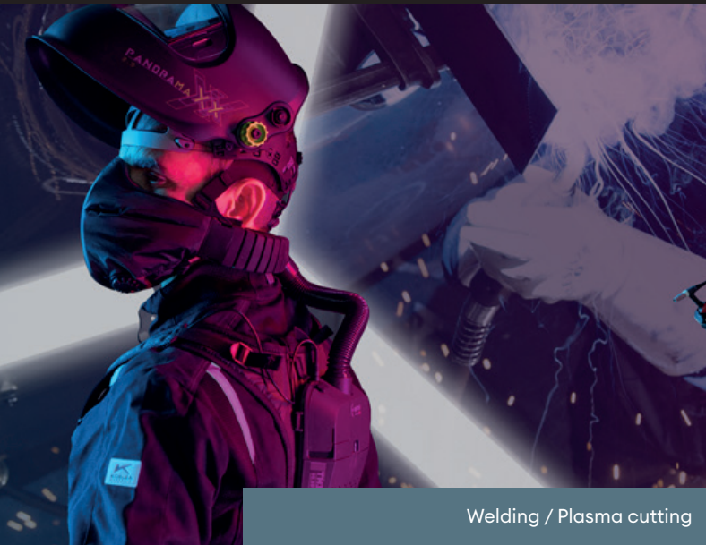
Welding / Plasma cutting