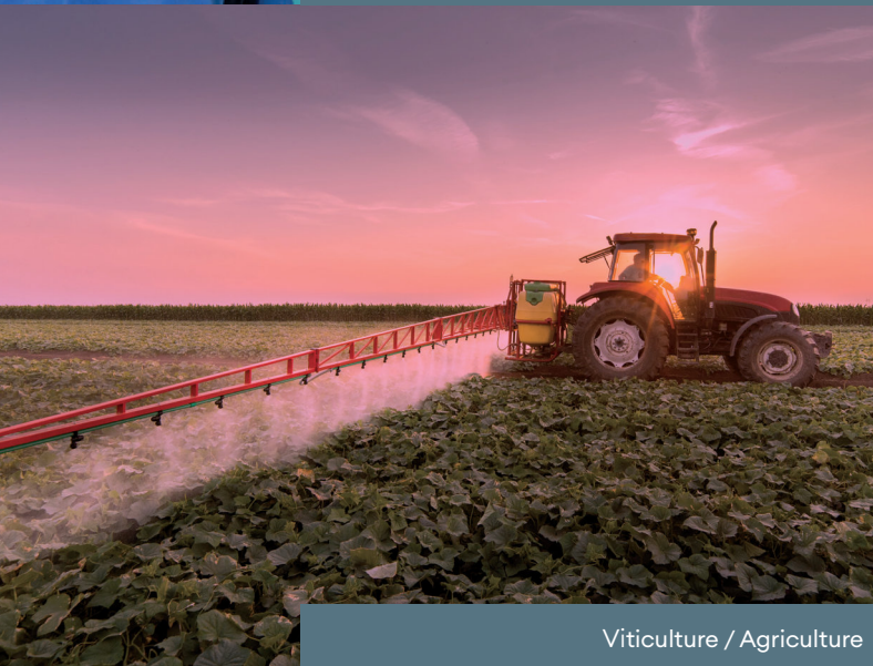
Viticulture / Agriculture