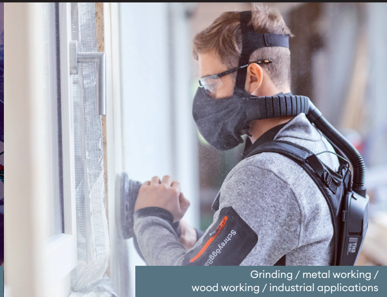
Grinding / metal working / wood working / industrial applications